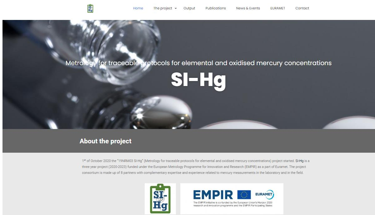
Figure 1. Home of the SI-Hg web page